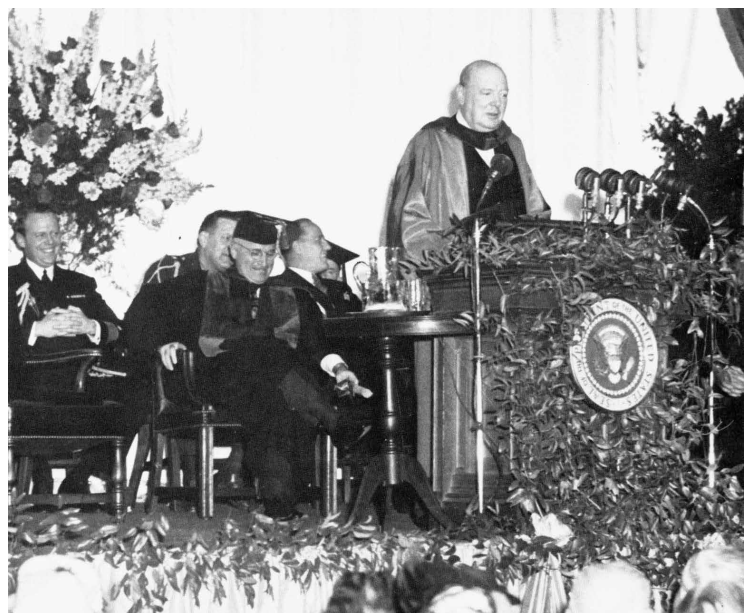
National Churchill Museum

thoritarian government, but to do so to prevent Moro from fundamentally transforming Italian politics by legitimizing a role in government for the Communist Party, the so-called “historic compromise.” This was an Italian version of the May 1978 deal between Soviet leader Leonid Brezhnev and German Chancellor