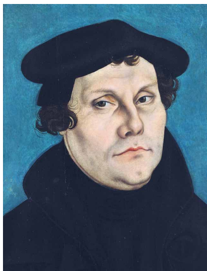
Portrait of Martin Luther by Lucas Cranach the Elder, 1528.