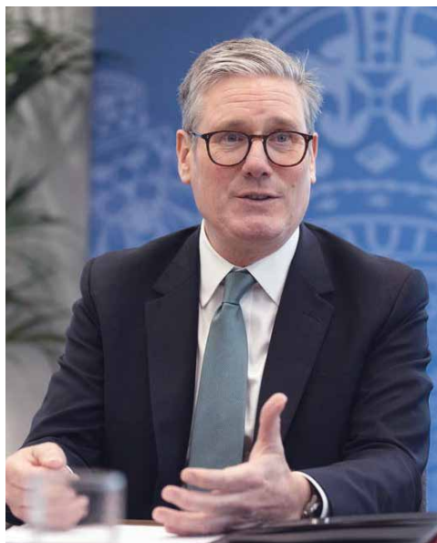
British Prime Minister Keir Starmer

Right now, we're going to face the violation of our Constitution, the bragging of our leaders that they have