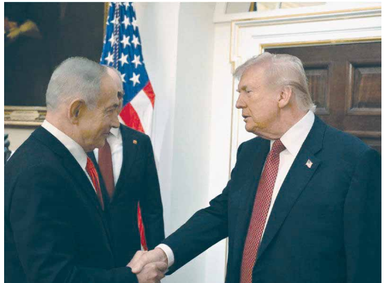
Israeli Prime Minister Benjamin Netanyahu with U.S. President Donald Trump at the White House, Feb. 11, 2026.

People back in the early 1930s in Germany decided they wouldn’t face it. And as one legal scholar at the time, watching things, January, February, March, April, and May of 1933, put it: The people knew what was going on, but they reacted with Schafsmässige Ergebenheit . Now, the English for that is “sheep-like submissiveness.” (It’s almost easier to pronounce that one in German, isn’t it?) Sheep-like submissiveness. So, I mean, we could do that, and then we’ll lose our republic—and then what becomes of our