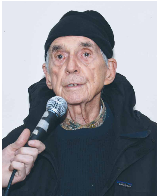
Father Daniel Berrigan

Let me add one other thing. I’m a Catholic and very much devoted to Father Daniel Berrigan, who was one of my tutors. At some point after he had been jailed several times for protesting the unjust war in Vietnam and revealing all the pus-flowing ugliness that came out of that, he was sort of on sabbatical down in South Africa, and they sent him to South Africa, which was then under Apartheid. And he was asked to preach during Holy Week, the week before Easter, as most of you know. And he preached at a white church, the only church he could preach at. And on Easter Sunday, he was receiving the people coming out of the church, and a middle-aged couple came up to him and said, “Father Berrigan, your words are eloquent, but if we risk prison, and if we do what you tell us to do, what becomes of our children?” And Berrigan looked them straight in the eyes, and