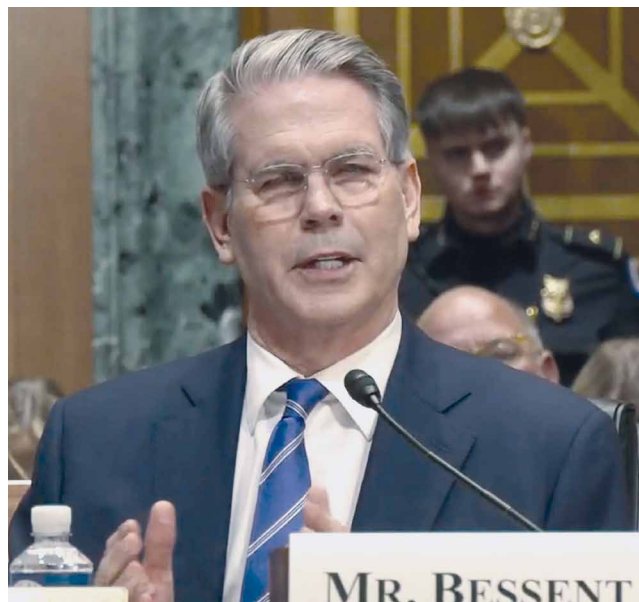
Senate Finance Committee U.S. Secretary of the Treasury Scott Bessent

President Trump’s policies have shown extraordinary power to kill jobs. The President fired the head of the Labor Department’s statistics bureau in the middle of the year, because the bureau wasn’t reporting enough job growth. Still, at year-end it reported just 584,000 net new jobs for 2025 in a labor force of 165 million workers; the net job growth for 2024 had been triple that, 1.6 million. The Bureau’s Quarterly Census of Employment and Wages, which