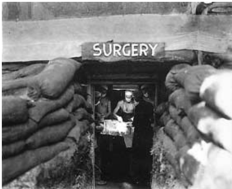
Battlefield medicine during World War II provided broad experience that allowed the United States to create an effective health-care system for the civilian population in peace-time.