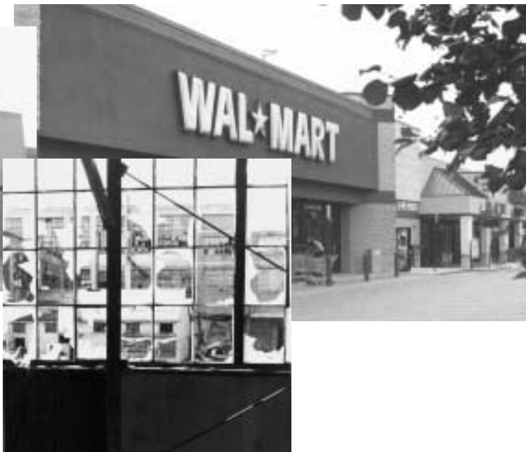
Wal-Mart is one of the biggest factors in causing unemployment in the United States, by squeezing out competitors with cut-rate prices, banning unions, eliminating U.S. vendors, and relying on imports produced by virtual slave labor abroad. Left to right: retailer Montgomery Ward closes in Michigan; the wreckage of a factory in Buffalo, New York; and Wal-Mart—“not a company, but an epidemic disease.”

financial market, which was specialized in this kind of thing, would organize a run, like a George Soros-type game, against some country—the way George Soros went at, particularly, Malaysia. They drive down the value on the international market—the trading value—in an orchestrated money market, like a rigged casino; they drive the value of the currency down on the international money-exchange market. Then, authorities go to the country and say, “Well, bring in the IMF! Bring in the World Bank, to advise you on how to deal with this problem.” The IMF would come in, and give the “advice” (or the World Bank): “Devalue your currency! Twenty, 30, 40, 50%!” Say, “Okay, we’ll do that, if that’ll work.”