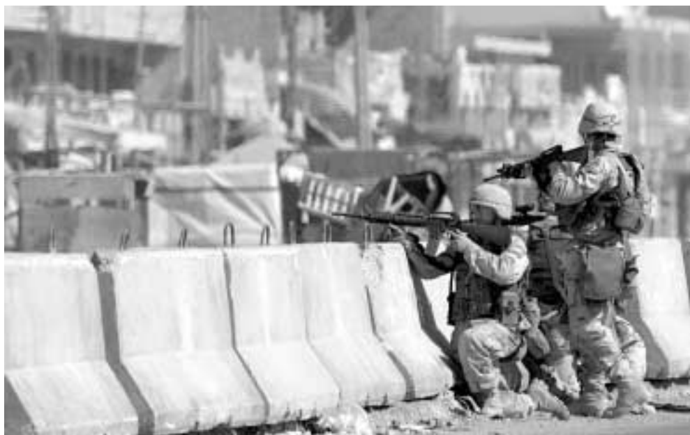
"This is not a mismanagement problem: The United States is losing the war! And, it's losing that war, in the same degree that it lost the war in Indo-China." Here, U.S. soldiers surround and search Abu Ghurayb Market in Baghdad, after a rocket-propelled grenade attack, Nov. 2.

with no apparent chance of reconquering the territory. The South Korean army was wiped out—didn't exist. An American force, based in the Pusan perimeter, the tip of South Korea, was holding on, based by support from Japan.