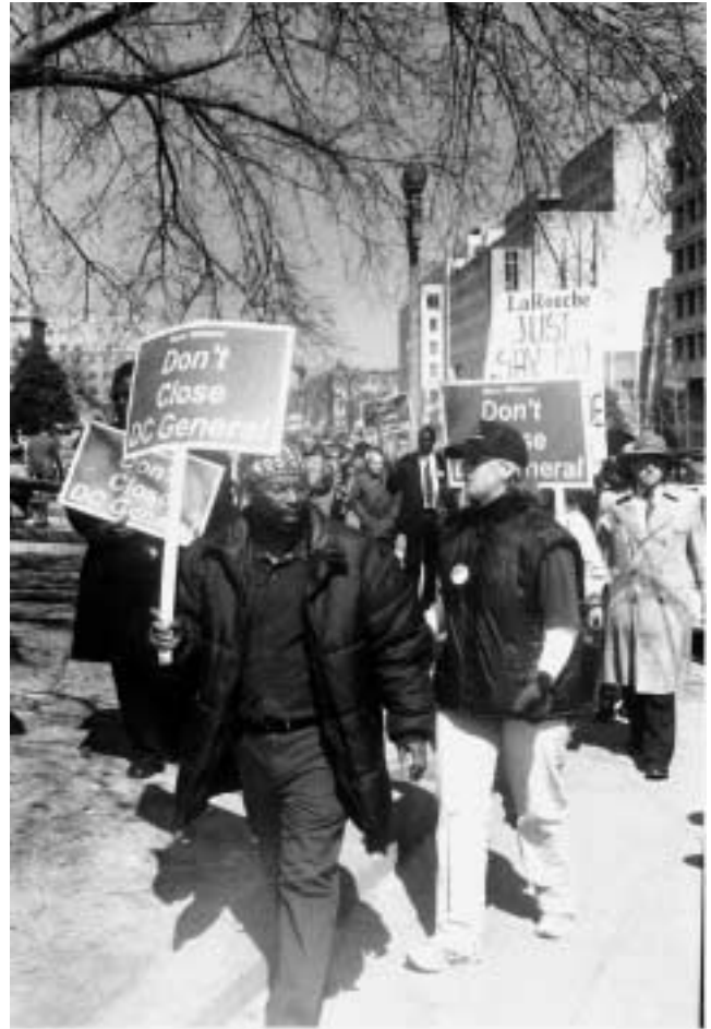
The LaRouche forces built a movement to save D.C. General Hospital (here, a rally on March 8, 2001). “The first hour I’m President, in the office, I will issue a Presidential order, setting into motion the immediate re-establishment of D.C. General Hospital. . . . At the same time, I will issue to Congress a Presidential directive, requesting the Congress to repeal HMO and restore the Hill-Burton law.”

And I think the American people, generally, are sick and tired of these damned bills! They don’t mean anything. They’re simply ways of saying, “Look, I did this! I gave you