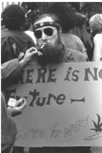
A Baby-Boomer proclaims, "There is no future," in this New York City "pot parade" in 1981. The children of the Boomers are, increasingly, unwilling to accept the fate their parents' hedonism has handed to them.

them, which had been living before, went away; became part of the counterculture. The first thing, the most immediate thing that turned adolescents or late adolescents, in the 1960s, into Baby-Boomers, was the fear of—number one: the Missiles Crisis of 1962, and the effect it had on them and their parents (they were old enough to be scared; they were not old enough to judge the situation); the assassination of Kennedy; and the beginning of the Indo-China War—a hopeless war, which they had no confidence in, no belief in.