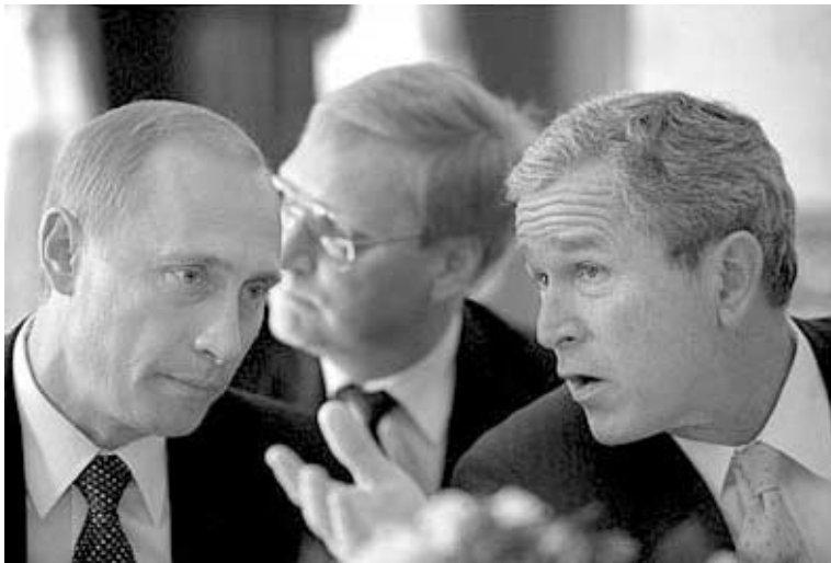
As a President from a ministerial—not political—background, Vladimir Putin views Russia's relationship with the United States as a primary concern. While seeking to cooperate with the United States, he also confronts the reality that the world is heading toward war, unless the policy of the neo-conservatives in Washington is changed.

Now, therefore, that's key to understanding the issue of the Yukos oil question, which is what's the Khodorkovsky case. Putin is working as an institutional person. Putin is a former member of the Foreign Service of the KGB, the Rus-