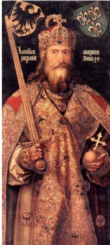
Charlemagne (747-814 A.D.), shown here in a painting by Albrecht Dürer, did much to develop the physical economy of Europe. Crucial features of his contributions lived on and helped to shape the later emergence of the Renaissance.

The most urgent political task among nations today, especially the trans-Atlantic ones, is to trace out the most essential elements of those methods of the August-